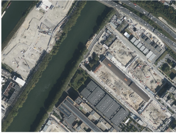
Figure 1.a: 20cm orthophoto